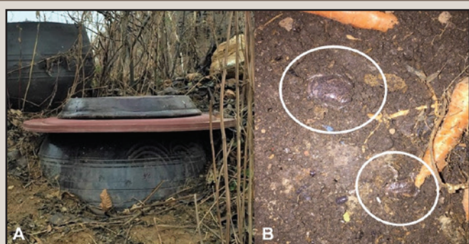
FIG. 1. An artificial hibernaculum (ceramic pot) utilized by Kaloula borealis (A) and the two individuals found in the pot (B).