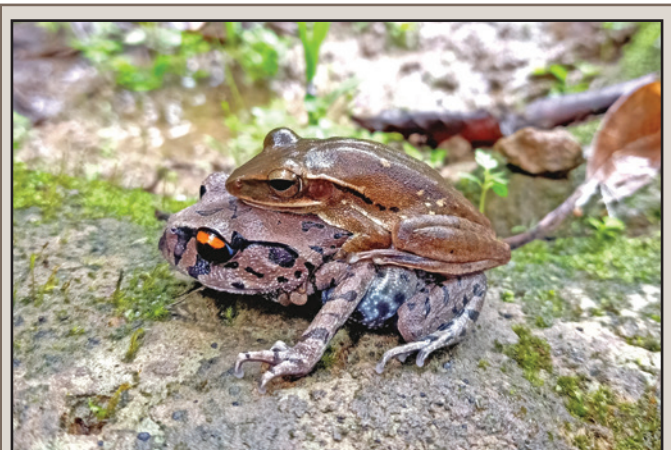
FIG. 1. Male Polypedates teraiensis amplexing a female Leptobrachium smithi at Dampa Tiger Reserve, Mizoram, India.