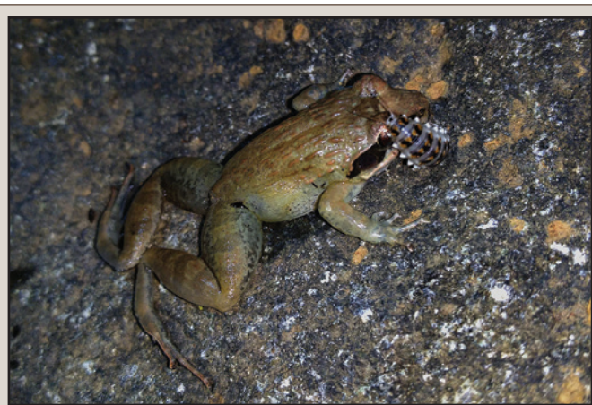
FIG. 1. Larva of Epomis sp. predating an Indirana chiravasi in Maharashtra, India.

known from Spain (Escoriza Boj et al. 2017. B. Asoc. Herpetol. Esp. 28:50–52), Madagascar, Israel, Sri Lanka, Japan, and India (Kulkarni et al. 2020. J. Bombay Nat. Hist. Soc. 117).